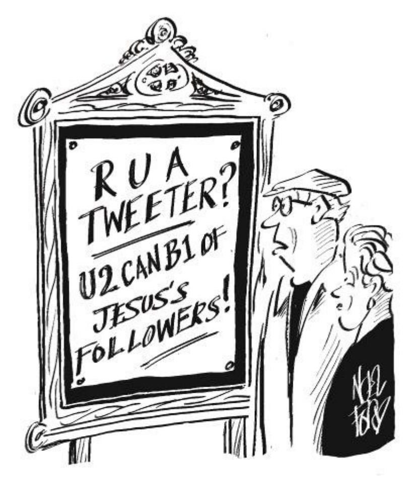
"To think we grumbled when the Church used unintelligible archaic language!"